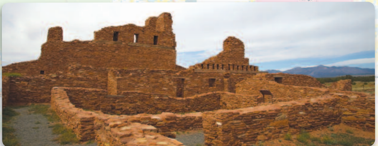
The proposed pipeline would have passed near the church at Abó, one of the Spanish-era ruins at Salinas Pueblo Missions National Monument; Puebloan sites along the route stretch back thousands of years.