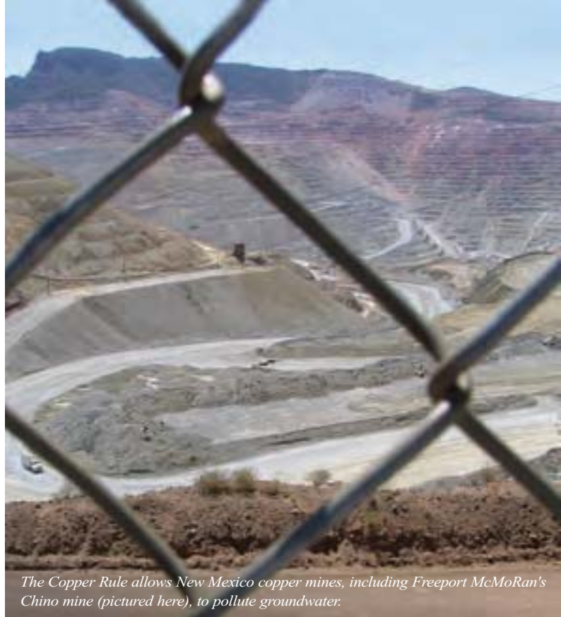
The Copper Rule allows New Mexico copper mines, including Freeport McMoRan's Chino mine (pictured here), to pollute groundwater.