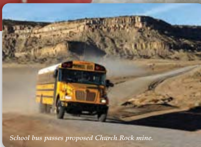
School bus passes proposed Church Rock mine.