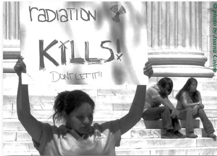
A member of Students Against Uranium Mining on the steps of the federal courthouse in May 2008.