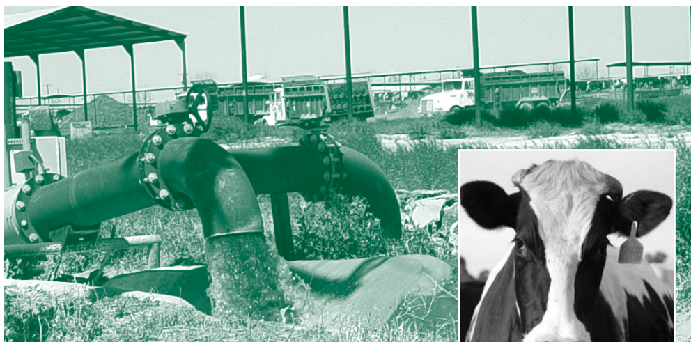
Liquid dairy waste pours from two pipes into a ditch that travels to nearby fields.