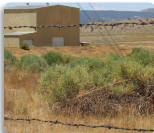
An old United Nuclear building sits on the site of a proposed uranium mine near Church Rock.

NMELC Staff Attorney Eric Jantz has worked with ENDAUM to fight proposed uranium mining in Diné communities since 2001.